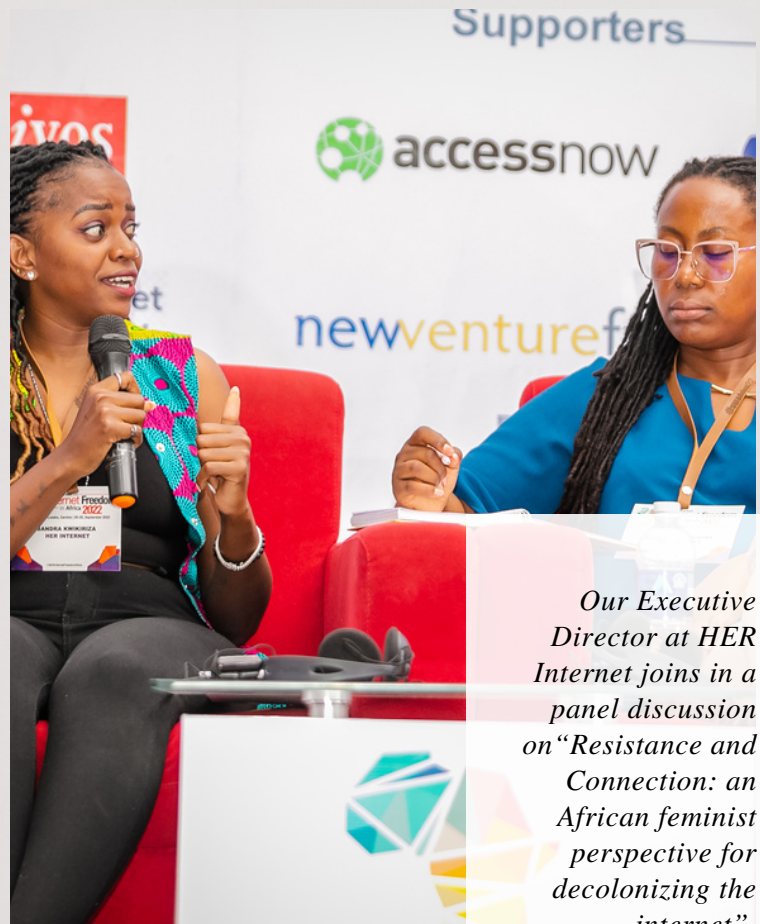
Our Executive Director at HER Internet joins in a panel discussion on “Resistance and Connection: an African feminist perspective for decolonizing the internet”

https://africanfeminism.com/resistance-connection-an-african-feminist-perspective-for-decolonizing-the-internet/