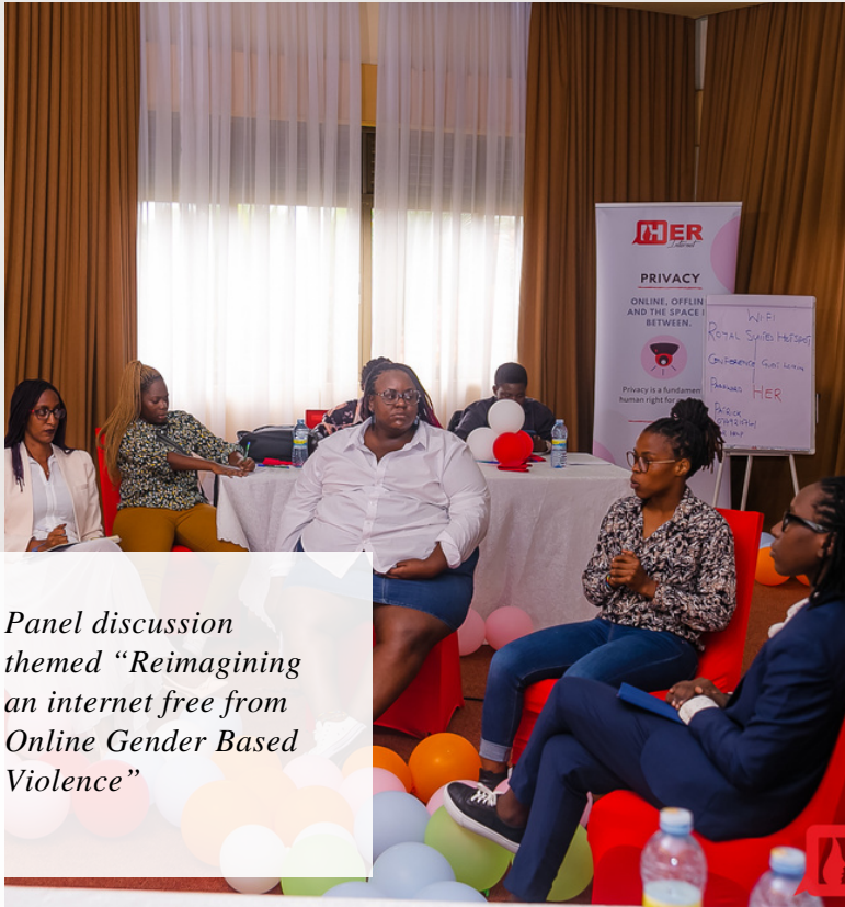
Panel discussion themed “Reimagining an internet free from Online Gender Based Violence”